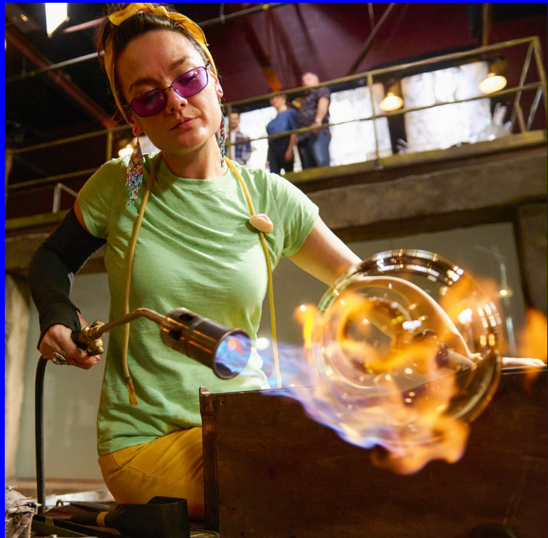
This month, the Pittsburgh Glass Center showcases work created by contestants from Netflix’s hit show “Blown Away.”