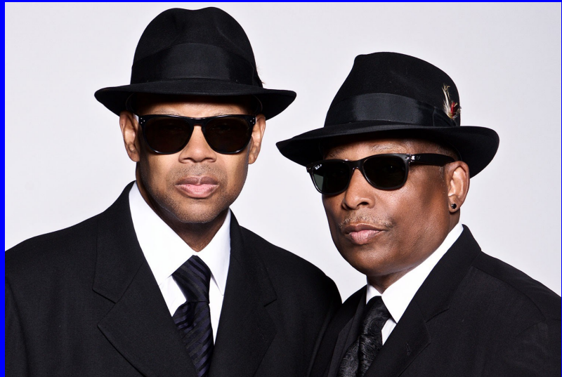
James "Jimmy Jam" Harris and Terry Lewis go from producing others' music to performing their own at this year's Pittsburgh International Jazz Festival.